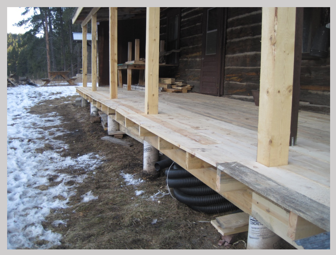
Photo E. The porch on the historic log house was reconstructed on the west side to remove its weight from the log wall, now resting on its own foundation. The south side was repaired. The lumber is rough sawn to be like the original. Logs were skidded to sawmill, cut into lumber and hauled to the site.