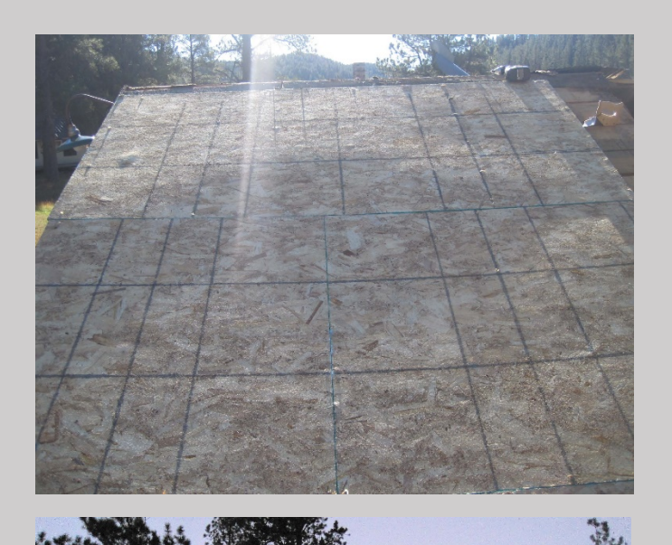
Photo B. With the structural damage to the rafters and chimney repaired, the roof was resurfaced with 4X8 sheets of OSB.

Photo C. With a new stronger subroof, a water tight barrier was applied as an underlayment before installing the metal roof.