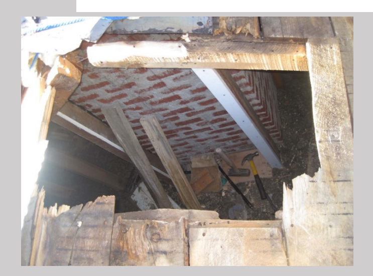
Photo A. The historic Hunter's cabin or north cabin had developed leaks in the roof causing water damage inside. In Winter/Spring of 2016, high winds blew dead bug trees onto the roof which caused structural damage.

Photo E. The porch on the historic log house was reconstructed on the west side to remove its weight from the log wall, now resting on its own foundation. The south side was repaired. The lumber is rough sawn to be like the original. Logs were skidded to sawmill, cut into lumber and hauled to the site.